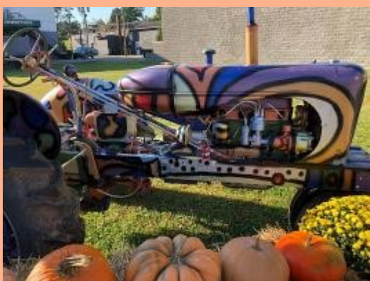
Bet ya' didn't know tractors could be so artistic! Check out page 7 to see it's location.

KYMS will be doing site visits in Salyersville, Paintsville, and Pikeville this week along with a regional board training. They will visit Harrodsburg and Danville late Friday and hope to visit Winchester on the 14th for the Upstairs/Downtown tour!