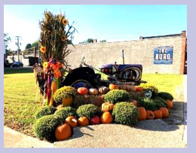
new sign and this tractor in downtown Williamsburg!