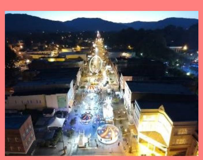
Media drone "Regis" from Hometowntv13 shows us a downtown view of the Cumberland Mountain Fall Festival in downtown Middlesboro Friday night!

Throughout October, anyone that purchases a 2018 Heart of Danville t-shirt will receive $5 off a hat or reusable shopping bag. Or purchase all three items for $40, that's like receiving the hat for free. Regular prices are T Shirts: $20, Hats: $15, Reusable shopping bags: $20