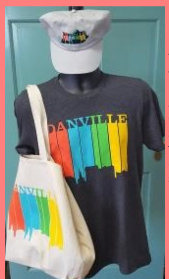
Heart of Danville is having a Merchandise Special!

After registering, you will receive a confirmation email containing information about joining the meeting.