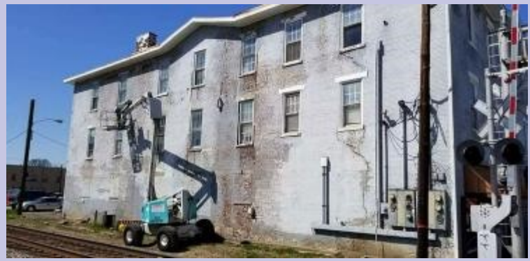
Restoration work taking place in Cynthiana!

We are so excited to see this transformation.